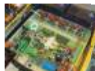
Low Pass Filter and RF Power Output Stage