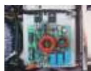
DC-DC Power Step-Down Converter